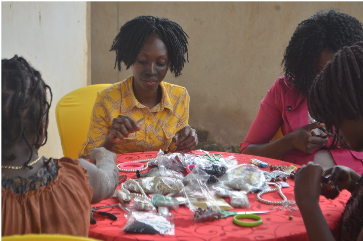
Acid survivors training in craft making