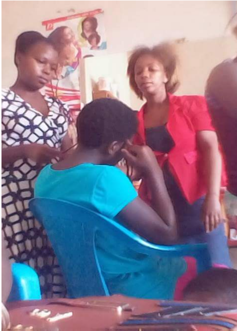
Girls during one of the training sessions

GCIU joined the rest of the world to make the 16 day of Activism against gender based violence which was held from Nov25 to Dec 10 2017. In conjunction with ‘End Acid Violence Uganda [EAVU] the organization held skill training with 10 victims in craft making. The training aimed at equipping the survivors with life skill that would enable them set up their own business since they confessed it hard to secure employment despite their abilities and qualification.