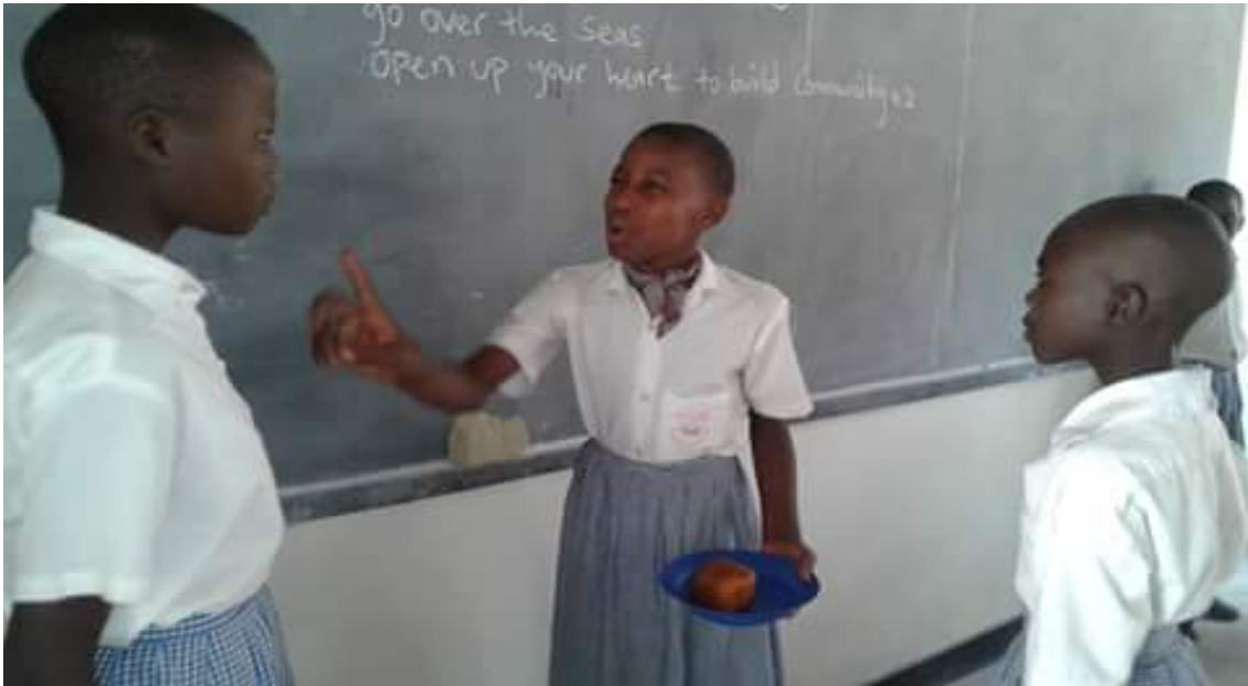
Pupils of Sam Iga Memorial Primary School acting in a skit

The out reaches are always participatory and pupils were trained in numerous skits, plays that would enable them understand the relevancy of staying in school to avoid becoming dropouts.