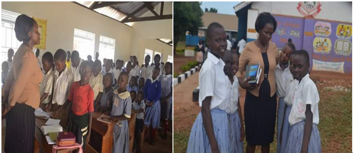
chool outreach at Sam Iga Memorial Primary School