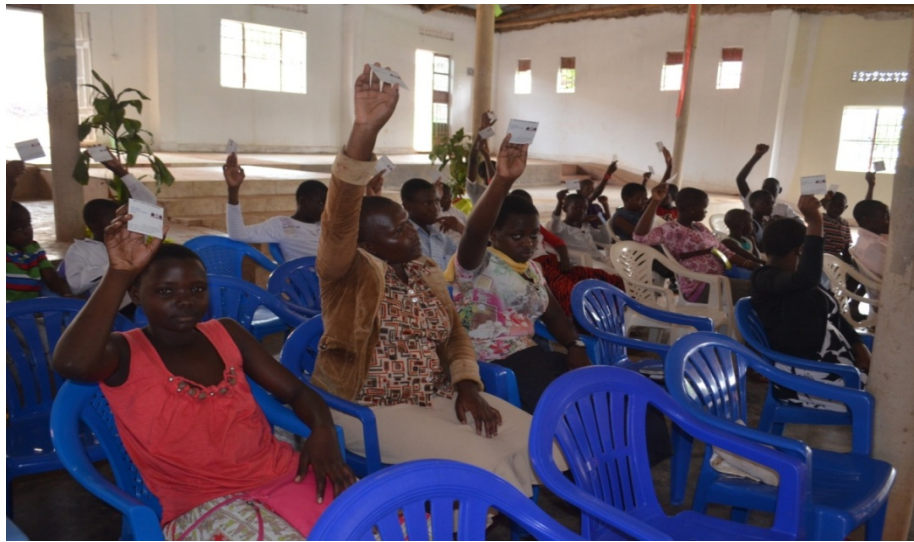
Girls displaying their commitment cards vowing to abstain from sex

Over 100 girls have been reached to in this back to back conferences and seminars and through several engagements more girls have made commitment to abstain from sexual intercourse and some have been equipped with relevant knowledge on how to keep from seductions of men.