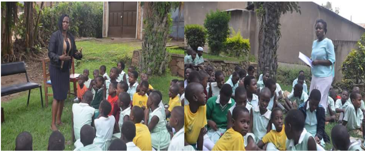
Advancing the 'No to Early Sex' Campaign at The Modern School Maganjo

Under this, the organization was able to reach to pupils at Sam Iga Memorial Primary School and Maganjo Modern Primary School with a theme “No to early sex” campaign with several topics including; relevancy of pursuing Education as a source of live hood and esteem, how to avoid unwanted pregnancies.