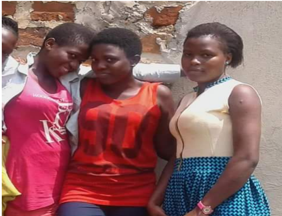
Some of the girls that rolled up for the program after registration

The organization launched out the skills development program for the first time and a total of ten girls registered to be trained in hair dressing. They await their certification with 2018 class.